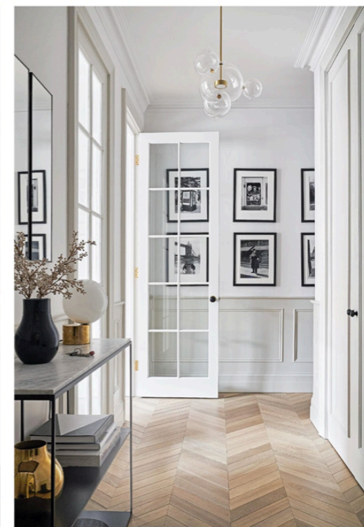
LIVING IN STYLE

“WITH A GLASS PARTITION YOU DON'T LOSE THE SENSE OF AN OPEN-PLAN SPACE”