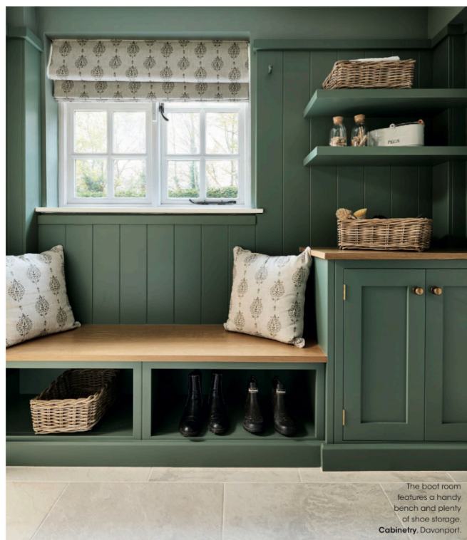
The boot room features a handy bench and plenty of shoe storage. Cabinetry, Davonport.