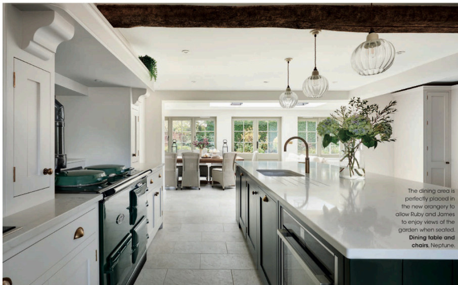
The dining area is perfectly placed in the new orangery to allow Ruby and James to enjoy views of the garden when seated. Dining table and chairs, Neptune.