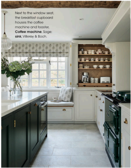
Next to the window seat, the breakfast cupboard houses the coffee machine and toaster. Coffee machine , Sage; sink , Villeroy & Boch.