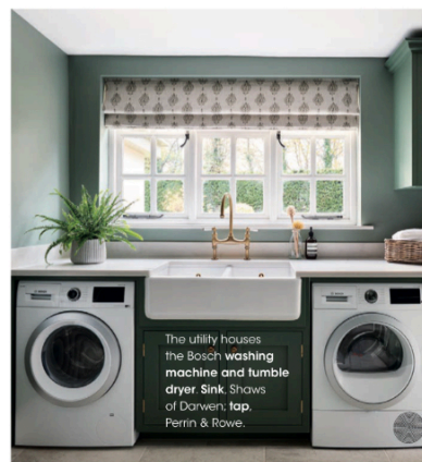
The utility houses the Bosch washing machine and tumble dryer. Sink, Shaws of Darwen; tap, Perrin & Rowe.

Kitchen Davonport 01206 760 800 davonport.co.uk Appliances Range cooker, Aga 0800 111 6477, agaliving.com , Oven, hob, fridge, freezer, dishwasher, Neff 0344 892 8989, neff-home.com , Wine cabinet, Caple 0117 938 1900, caple.co.uk , Washing machine, tumble dryer, Bosch 0344 892 8979, bosch-home.co.uk Worktops Nile Trading 01992 639 139, nilestone.co.uk Sinks Villeroy & Boch, villeroy-boch.co.uk , Shaws of Darwen 01254 775 111, shawsoldarwen.com Boiling-water tap Quooker 0161 768 5900, quooker.co.uk Tap Perrin & Rowe 01708 526361, perrinrowe.co.uk For full stockist information, see pages 142. Search for more suppliers at thesethreerooms.com/directory RBR