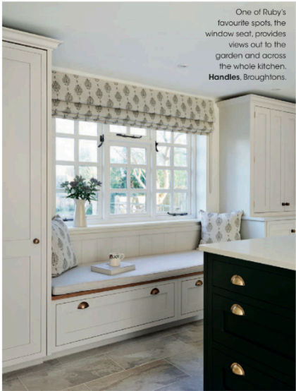
One of Ruby's favourite spots, the window seat, provides views out to the garden and across the whole kitchen. Handles , Broughtons.