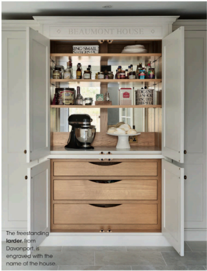
The freestanding larder , from Davenport , is engraved with the name of the house.