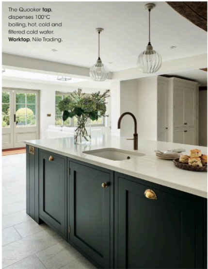
The Quooker tap , dispenses 100°C boiling, hot, cold and filtered cold water. Worktop , Nile Trading.